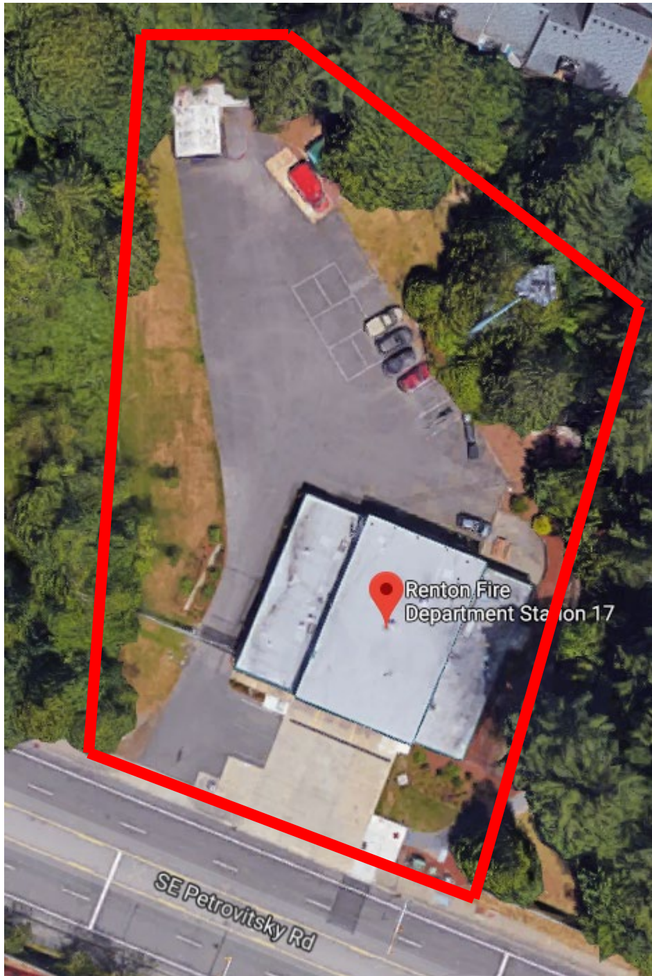
Site 7: Station 17 - 14810 SE Petrovitsky Road