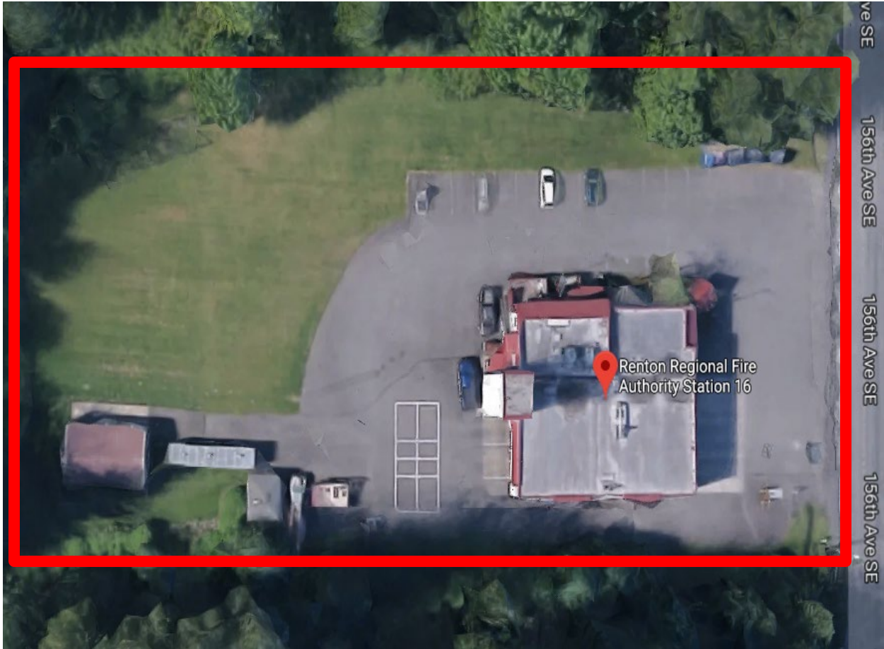
Site 6: Station 16 - 12923 156 th Ave SE